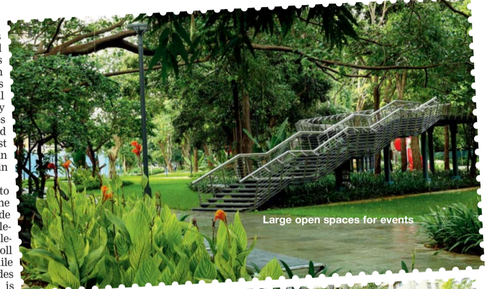
Large open spaces for events

When the day draws to a close, you can't miss the elegant lighting that fills the entire Community Park with colourful fluorescence and shades. The lighting concepts here also complement the saturation of hues in tropical flowers and leaves. Among many trees on the park's walk-