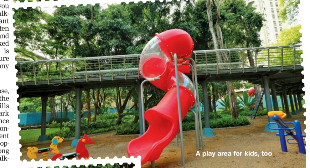
A play area for kids, too