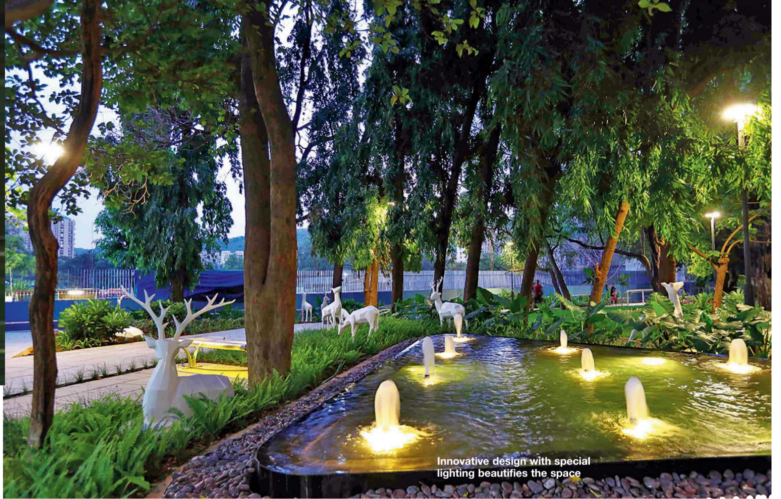
Innovative design with special lighting beautifies the space